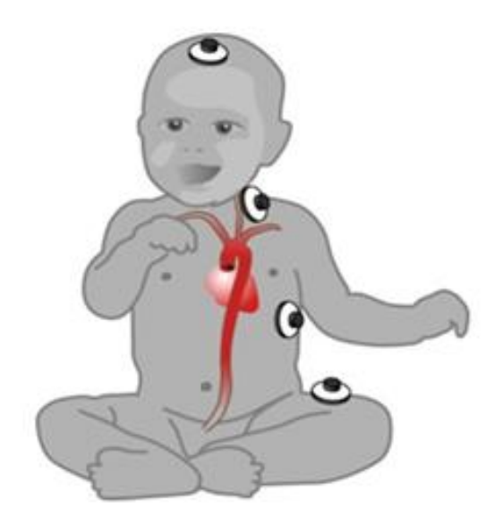
Figure 1: EC electrode array for measuring Thoracic Electric Bio impedance (TEB)

future research and improvements will be discussed.